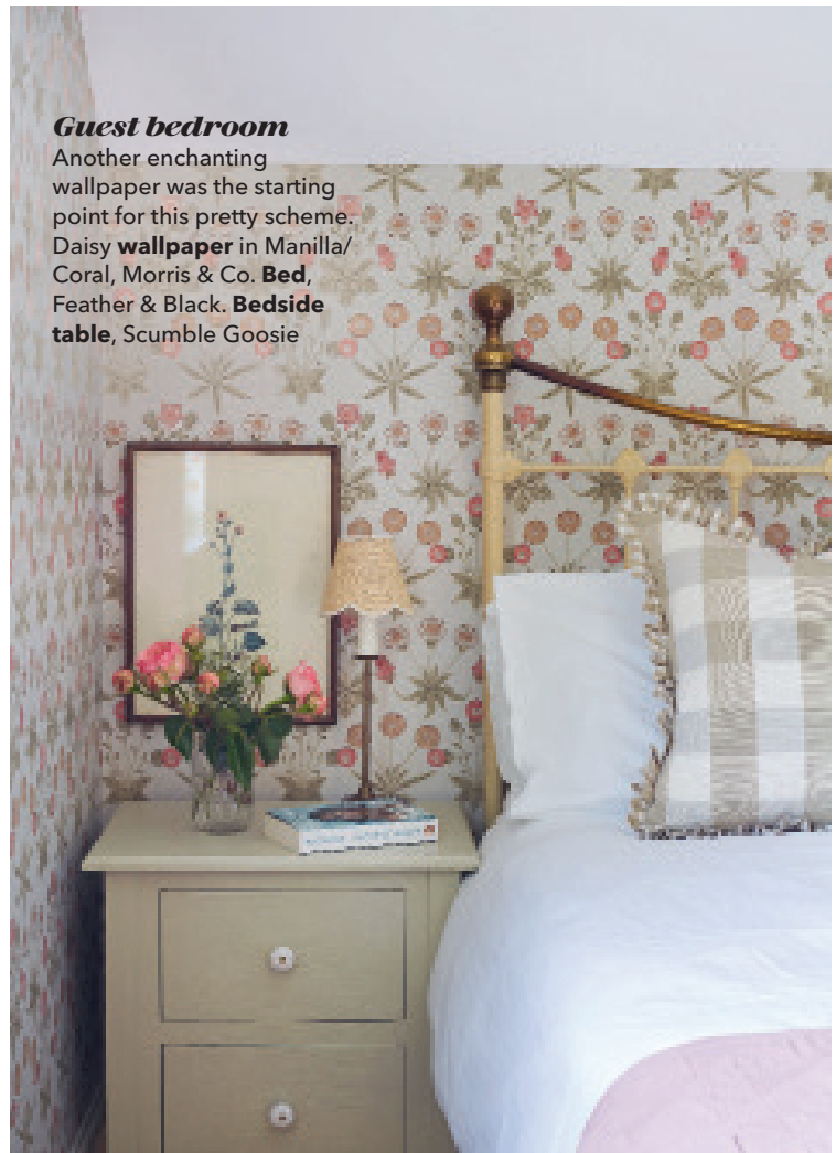
Guest bedroom Another enchanting wallpaper was the starting point for this pretty scheme. Daisy wallpaper in Manilla/Coral, Morris & Co. Bed , Feather & Black. Bedside table , Scumble Goosie