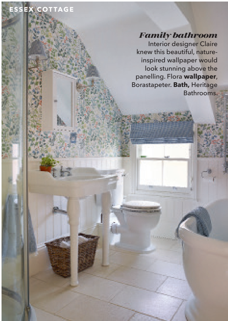
Family bathroom Interior designer Claire knew this beautiful, nature-inspired wallpaper would look stunning above the panelling. Flora wallpaper , Borastapeter. Bath , Heritage Bathrooms.